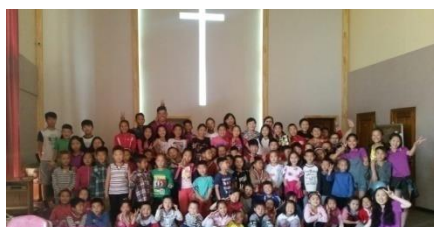
Chingeltei UMC – Summer School