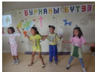
Yeruu UMC – Praising