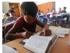
Youth discipleship training