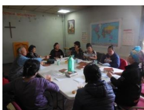
Senior citizen's Bible study