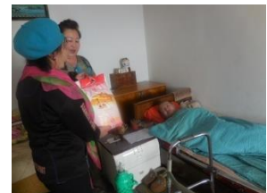
Visitation for patient