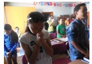
Youth disciple's training