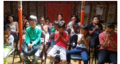
Takhilt UMC-Children's worship(pray)