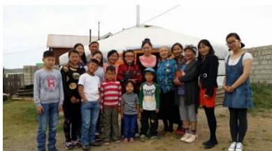
Takhilt-After Adults worship