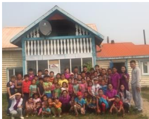
Yeruu UMC - VBS