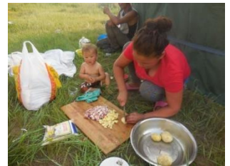
Preparing for Teacher's dinner