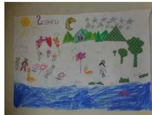
Yeruu-2nd grader's work